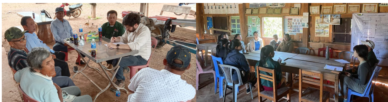
Photographs from the FGDs with community members

Community members were consulted using a semi-structured Focus Group Discussion (FGD) approach. The study team facilitated the FGDs with translation provided by MAG community liaison staff. In total 11 FGDs were held in 10 locations, including 48 women and 45 men. This usually included village leaders and members of the local women's groups and women's unions, as well as ordinary villagers. Where possible, the FGDs were divided by gender. Participants were all adults ranging from their late teens until their late 70s, with many participants aged around 40-60 years old.